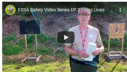
Establishing & Maintaining Firing Lines